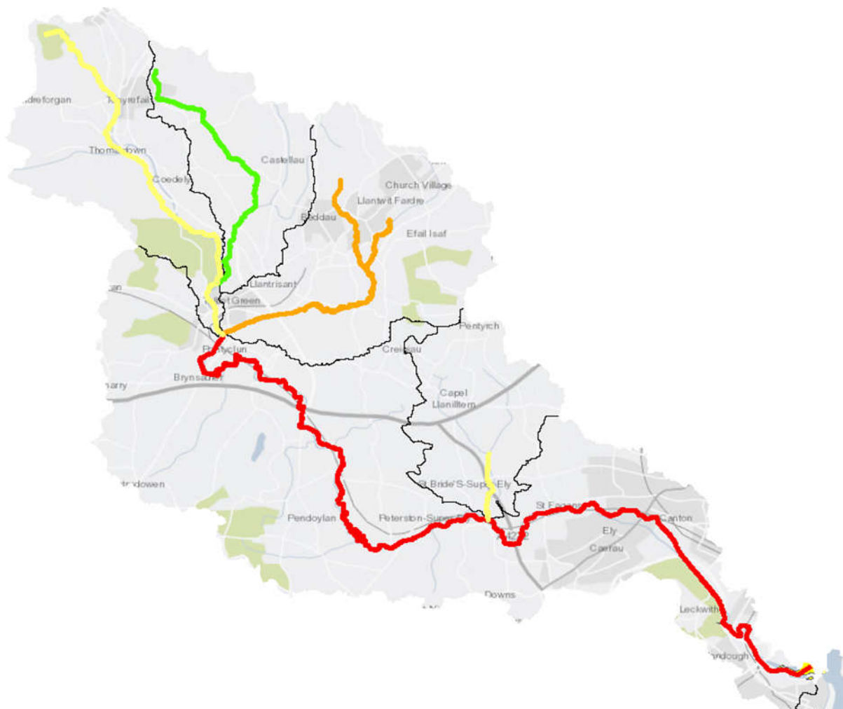
Diagram 1 – The River Ely